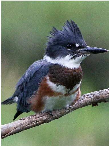
A BELTED KINGFISHER