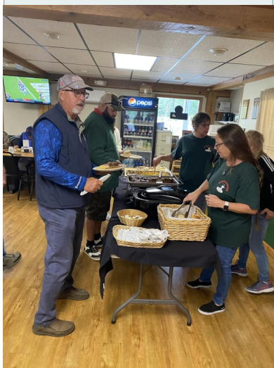
Good Eats After Play

Indicate which raffle you want to enter. If no choice is indicated the default will be for the Rifle.