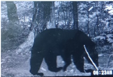
Bears visiting a bait site caught on a game camera.