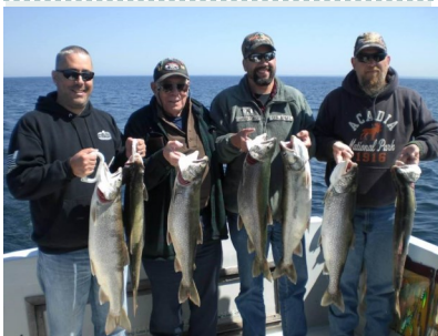
VETERAN FISHING TRIPS

...thank you to all the veterans, first responders, and law enforcement officers for your service!