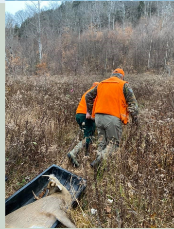
Whitetail Deer Hunt

"I just want to say thank you for all that you and the program does for our veterans. It meant the world to me to get out with like minded people with a goal to accomplish. Since retiring from the Army, its been a difficult transition for me and this trip really helped