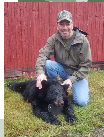
Nice Bear Harvested