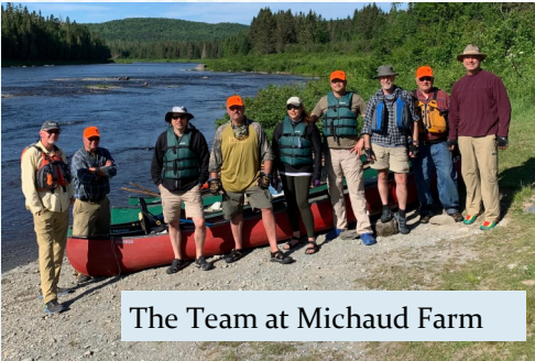
The Team at Michaud Farm

Six Veterans representing the Army, Coast Guard, Marine Corps and Navy and one Law Enforcement Officer undertook the arduous ninety mile Allagash Wilderness Ca-