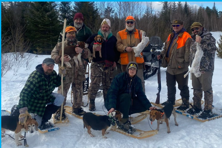
A View From a March 2023 Hare Hunt

Note: This list is not all inclusive as events may be deleted or added and tailored to specific individual or group needs that develop during the year.