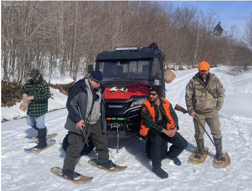
When I was younger, these were easy, not so now!