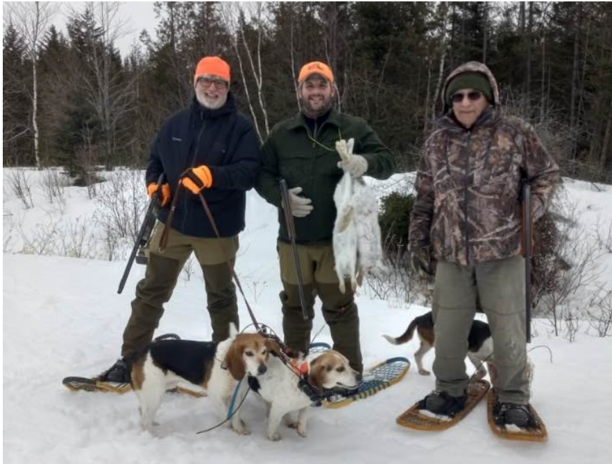
Rabbit Pie Coming Up